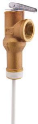
ML8346 is shown