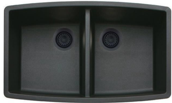
Model LX440069 shown in ANTHRACITE